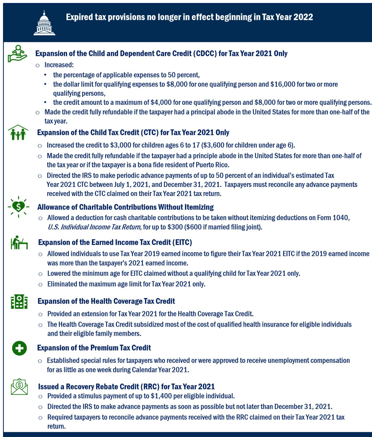
Figure 3: Summary of Expired Tax Provisions Affecting the 2023 Filing Season

Source: American Rescue Plan Act of 2021 and Consolidated Appropriations Act of 2021.